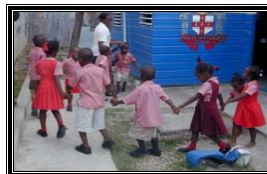
Children at Samuel Richards Basic, Spanish Town, newly adopted P.A.C.E. School, playing ring game.

As of April 2006, a total of 165 Basic schools have been adopted in Jamaica. PACE's Adopt-A-School program contributes over $2 million Jamaica dollars annually to these adopted Basic Schools. PACE's long-term goal is to enable the adoption of all Basic Schools in Jamaica.