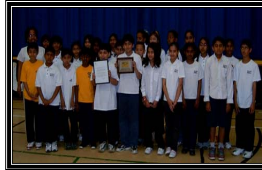
Class 5A at Beaumonde Heights Middle School proudly displays their award.

pilot, PACE intends to expand the program nationally.