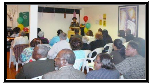
AAS "Class" in progress