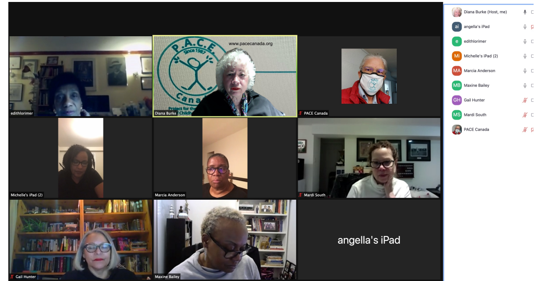
ZOOM Board meeting