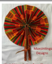
Maxintings Designs West African designs from Ghana