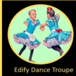
Edify Dance Troupe