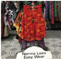
Norma Lee's Easy Wear