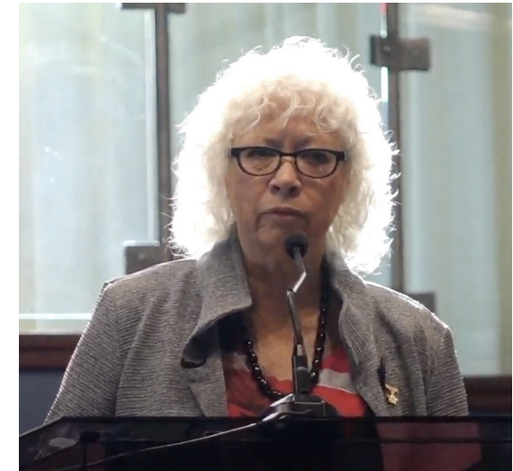
Hon. Seaga Tribute 2019