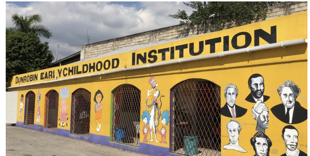
Model School – Dunrobin ECI